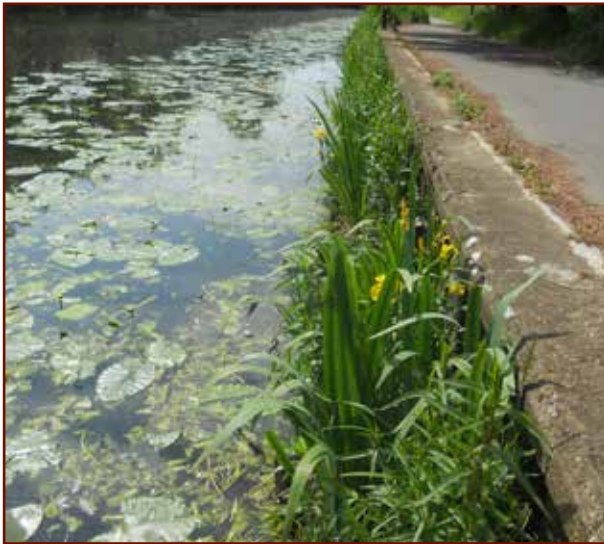
Coir Rolls in Peterborough in early June

Although not a project associated with the Nene Catchment Partnership, the coir rolls project has been an inspiration to the partnership. The coir rolls were installed intermittently along 640m of concrete towpath through the NIA River Restoration project. The works finished in early June and the plants have established themselves superbly over the summer months. The use of the extra habitat can be visibly seen when walking alongside the river with fry, moorhen chicks and larger fish utilising the cover provided by the coir rolls.