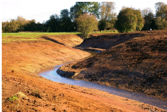
River Ise restoration at Tailby Meadow LNR from the Revital-Ise project