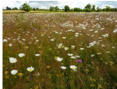
Left: SSSI meadow at Achurch now buffered by 15ha of restored meadow Right: 14ha of new meadow created at Upper Heyford in 2008 (photo taken in 2010).